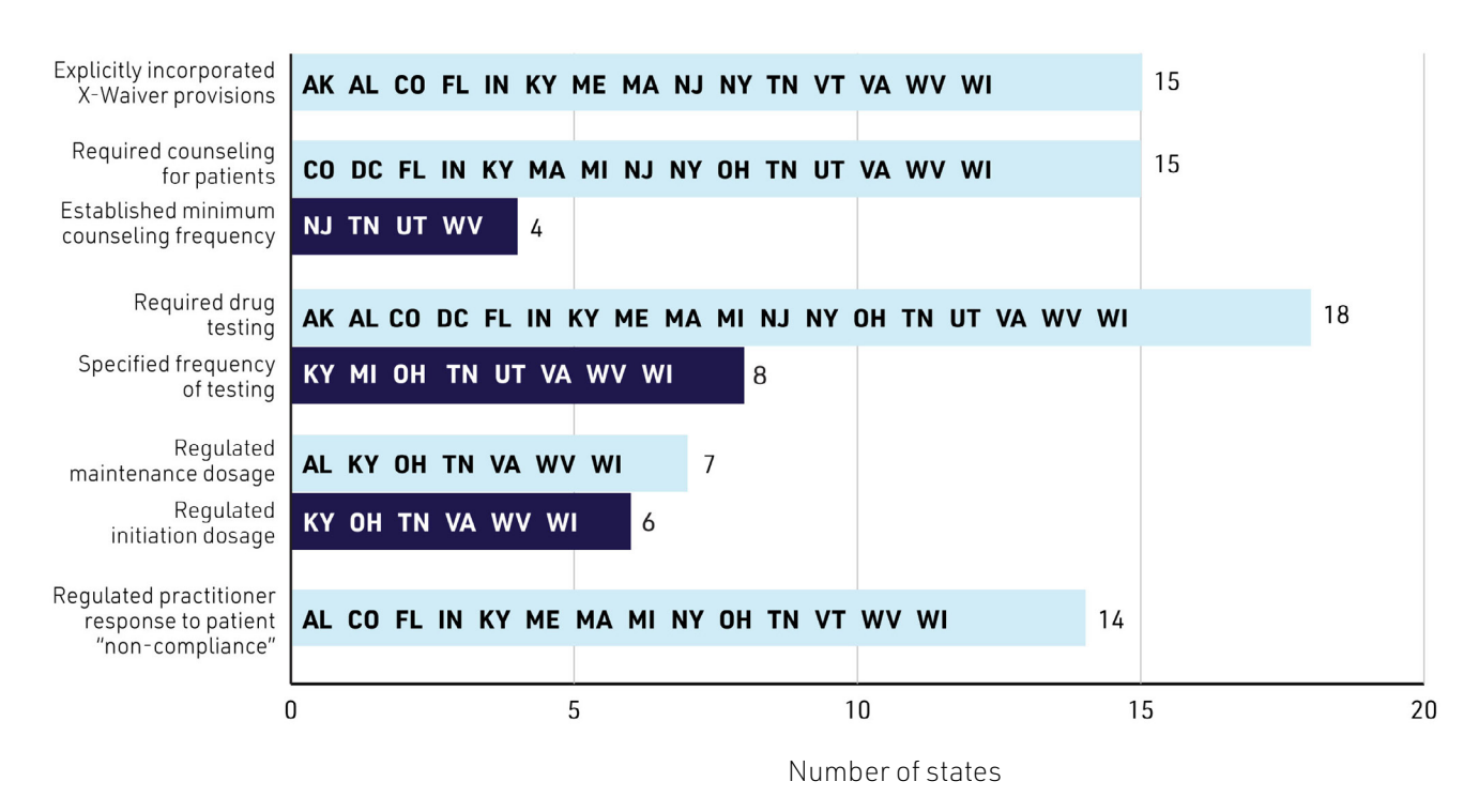
Figure 2. Notable buprenorphine provisions as of March 1, 2023 \,

As implicitly reflected by the movement toward deregulation by federal lawmakers and explicitly reflected in recent federal guidance, <sup>19</sup> restrictive regulations of buprenorphine prescribing for OUD create barriers to access for this lifesaving treatment. These barriers may exacerbate existing disparities in treatment outcomes among traditionally marginalized populations such as Black and Hispanic patients, <sup>20</sup> and research suggests their removal may have outsized benefits for certain racial or ethnic minorities. <sup>21</sup> The recent repeal of the X-Waiver and associated requirements provide state policymakers with an opportunity to revisit any existing laws on the issue, and to strongly consider applying a low-barrier (also referred to as low-threshold) buprenorphine treatment framework to their policy decision-making. For example, policymakers could follow the lead of four states (IN, NY, OH, WI) that codified requirements regarding the provision of or prescription for opioid overdose reversal drugs (e.g., naloxone), or the three states (MA, NY, VT) that prohibit involuntary discharge from treatment in response to one or more types of patient non-compliance. <sup>10</sup> Within a low-barrier buprenorphine treatment framework, policymakers can prioritize same-day treatment entry, a harm reduction approach, flexibility, and availability of treatment in non-traditional settings. <sup>19, 22</sup>